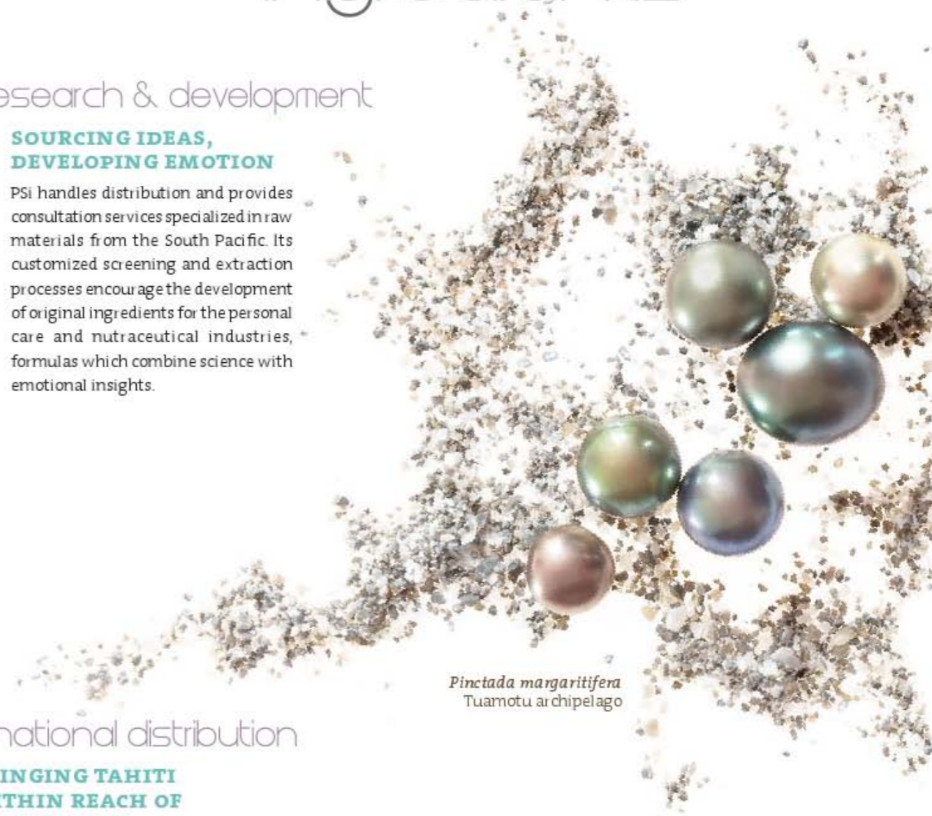
Pinctada margaritifera Tuamotu archipelago

PSi handles distribution and provides consultation services specialized in raw materials from the South Pacific. Its customized screening and extraction processes encourage the development of original ingredients for the personal care and nutraceutical industries, formulas which combine science with emotional insights.