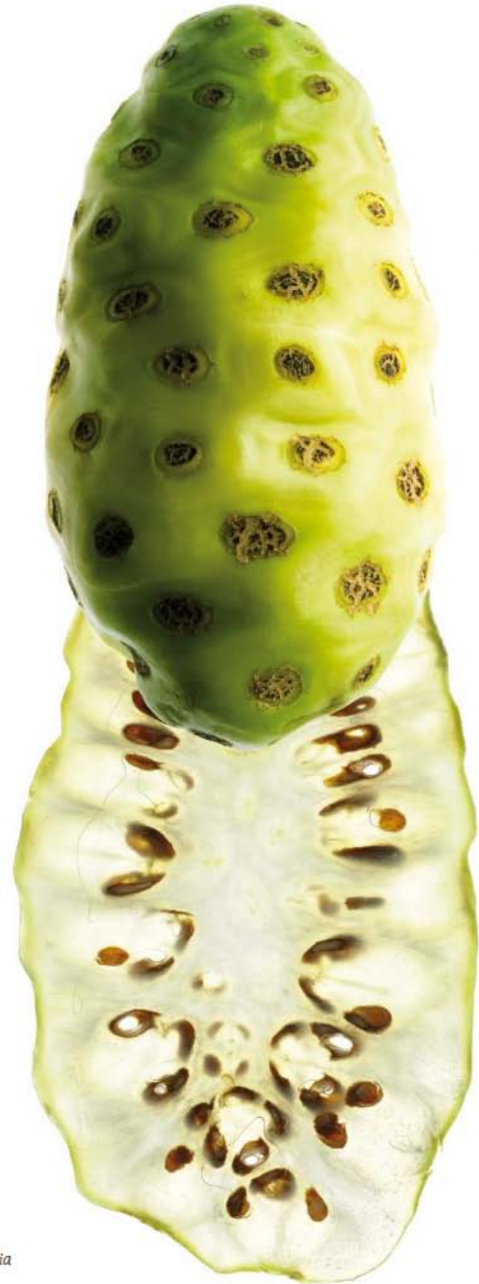
Morinda citrifolia Tahiti Island